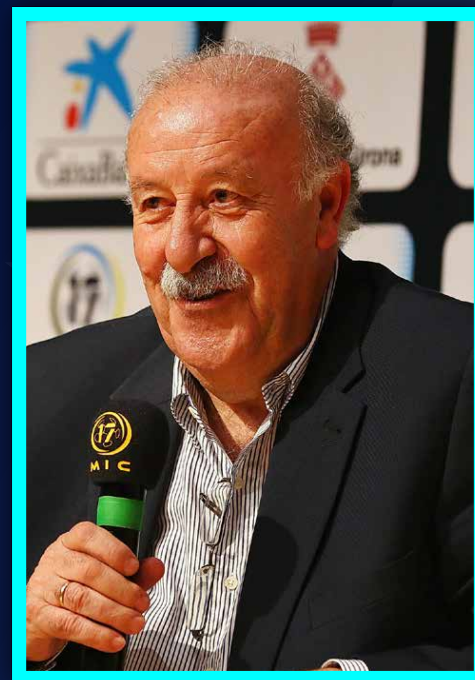
Vicente del Bosque (2017)