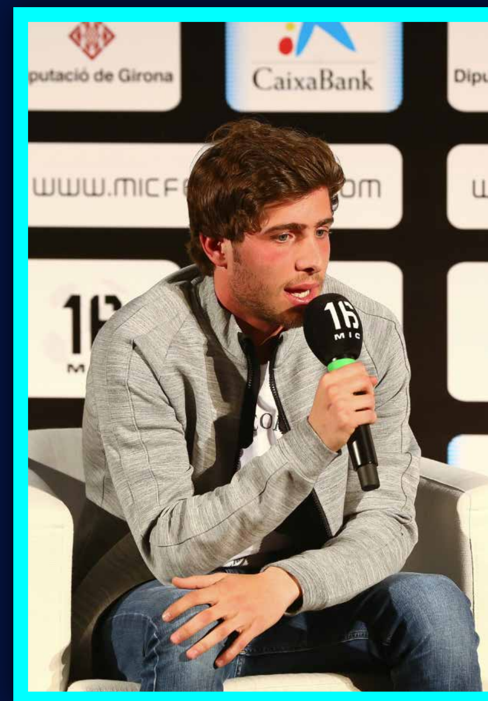
Sergi Roberto (2016)