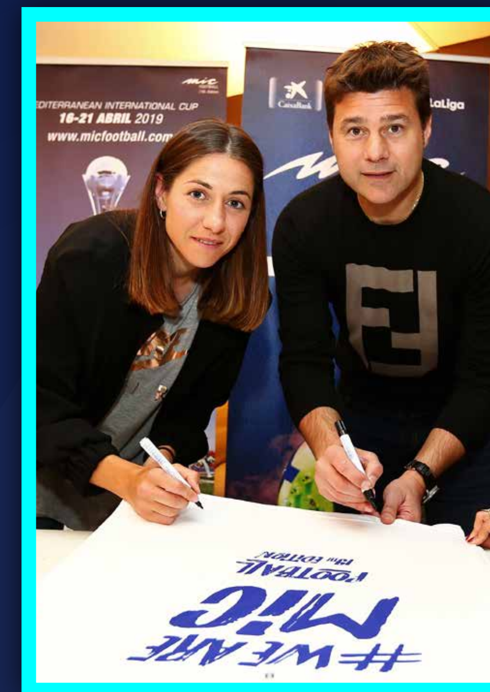
Vicky Losada i Pochettino (2019)