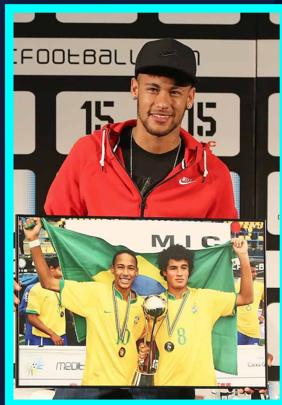
Neymar Jr (2015)